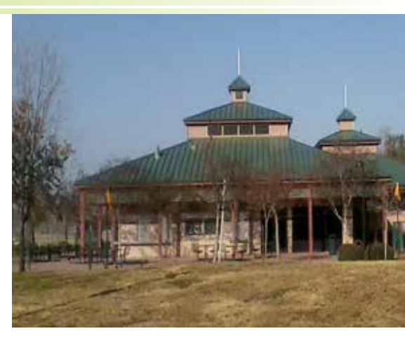
Prosperity Sports Park Clubhouse 846 W. Prosperity Avenue