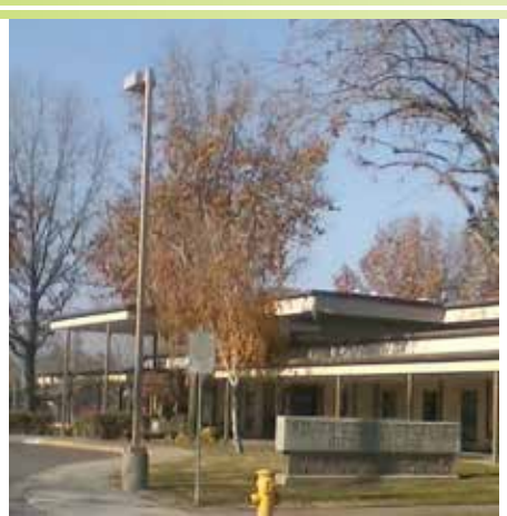
Senior Community Center 201 North F Street