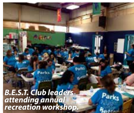
B.E.S.T. Club leaders attending annual recreation workshop.

B.E.S.T. stands for Bringing Everyone's Strengths Together. The Recreation Department provides a place where your Kindergarten through 6th grade student can feel safe, increase strength and fitness by participating in group activities, expand their creativity and enjoy socialization. Recreation leaders are on site to provide arts and crafts, music, movies, games, sports and special events.