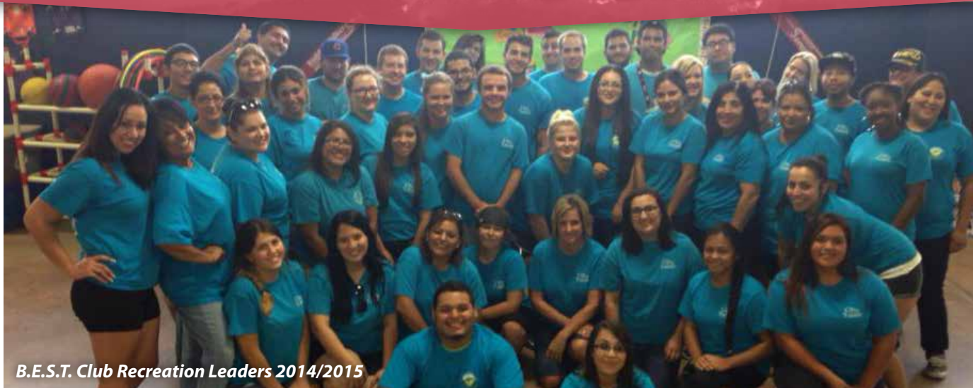
B.E.S.T. Club Recreation Leaders 2014/2015

There are nine afterschool sites for you to select. BEST Clubs observe the same schedule as Tulare City School District. Program sites are open until 5:30 p.m. on regular school days, early release and minimum days.