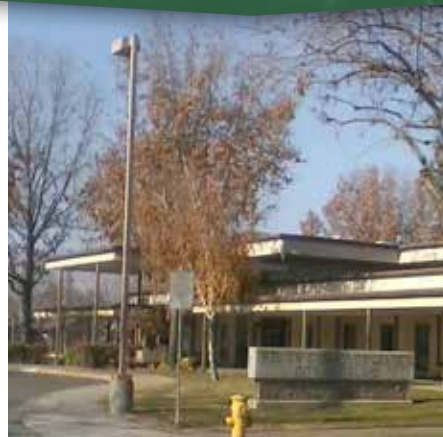
Senior Community Center 201 North F Street