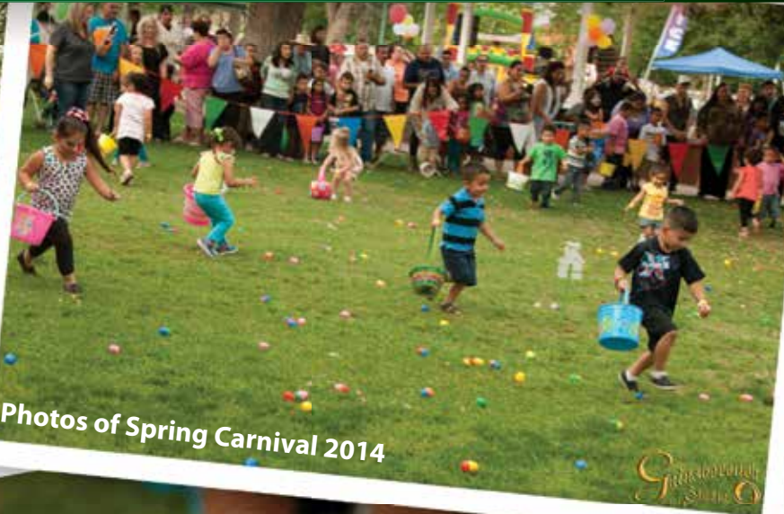
Photos of Spring Carnival 2014