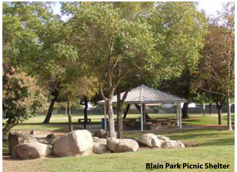
Blain Park Picnic Shelter