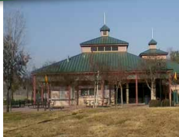
Prosperity Sports Park Clubhouse 846 W. Prosperity Avenue