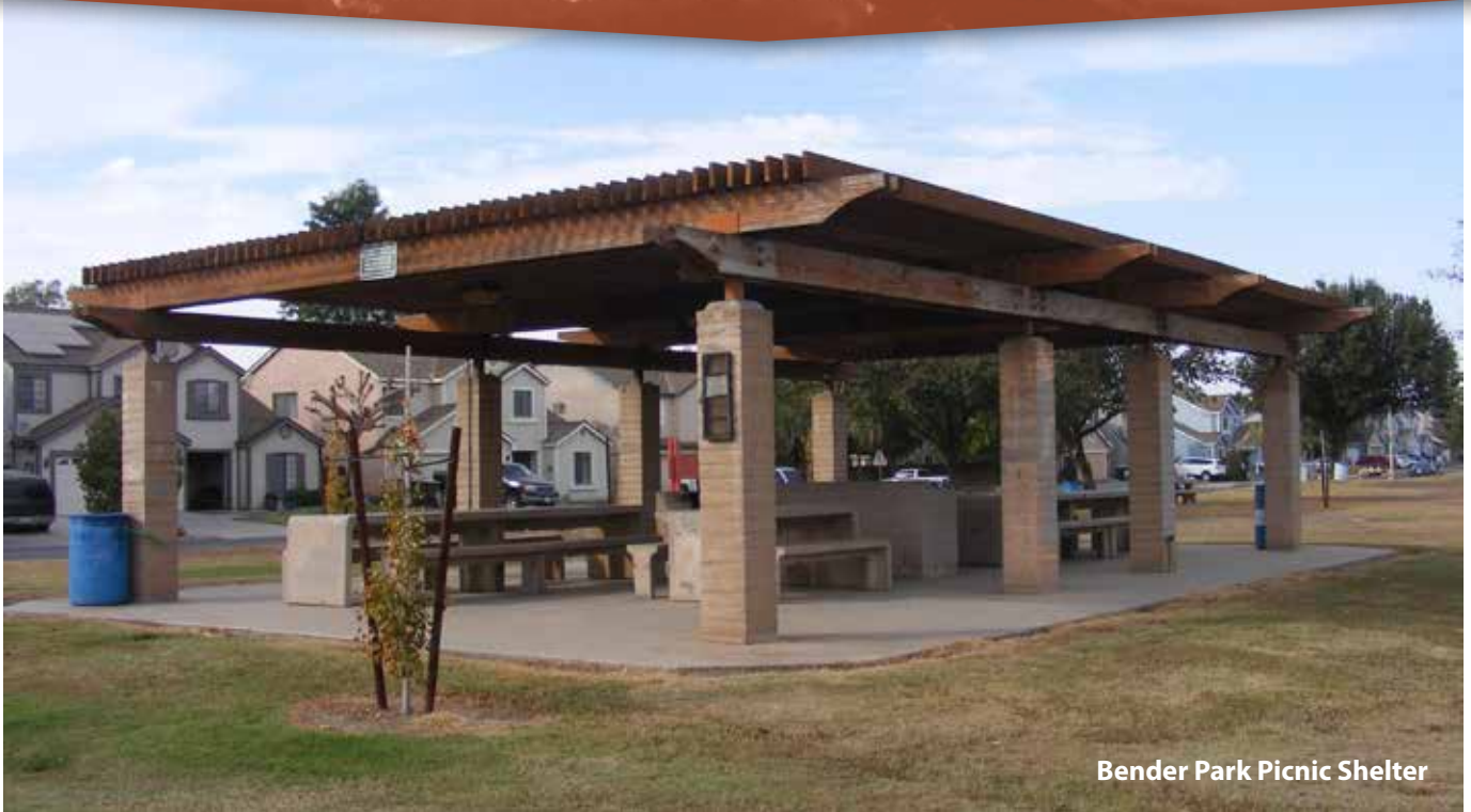
Bender Park Picnic Shelter

To rent a picnic shelter, visit the Department office at 830 S. Blackstone Street, inside the Meitzenheimer Community Center.