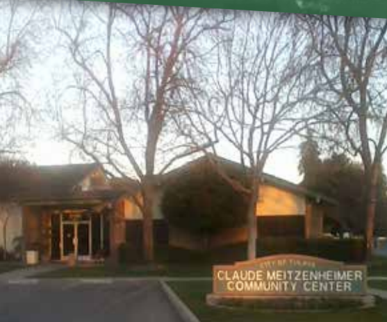
Meitzenheimer Community Center 830 S. Blackstone Street