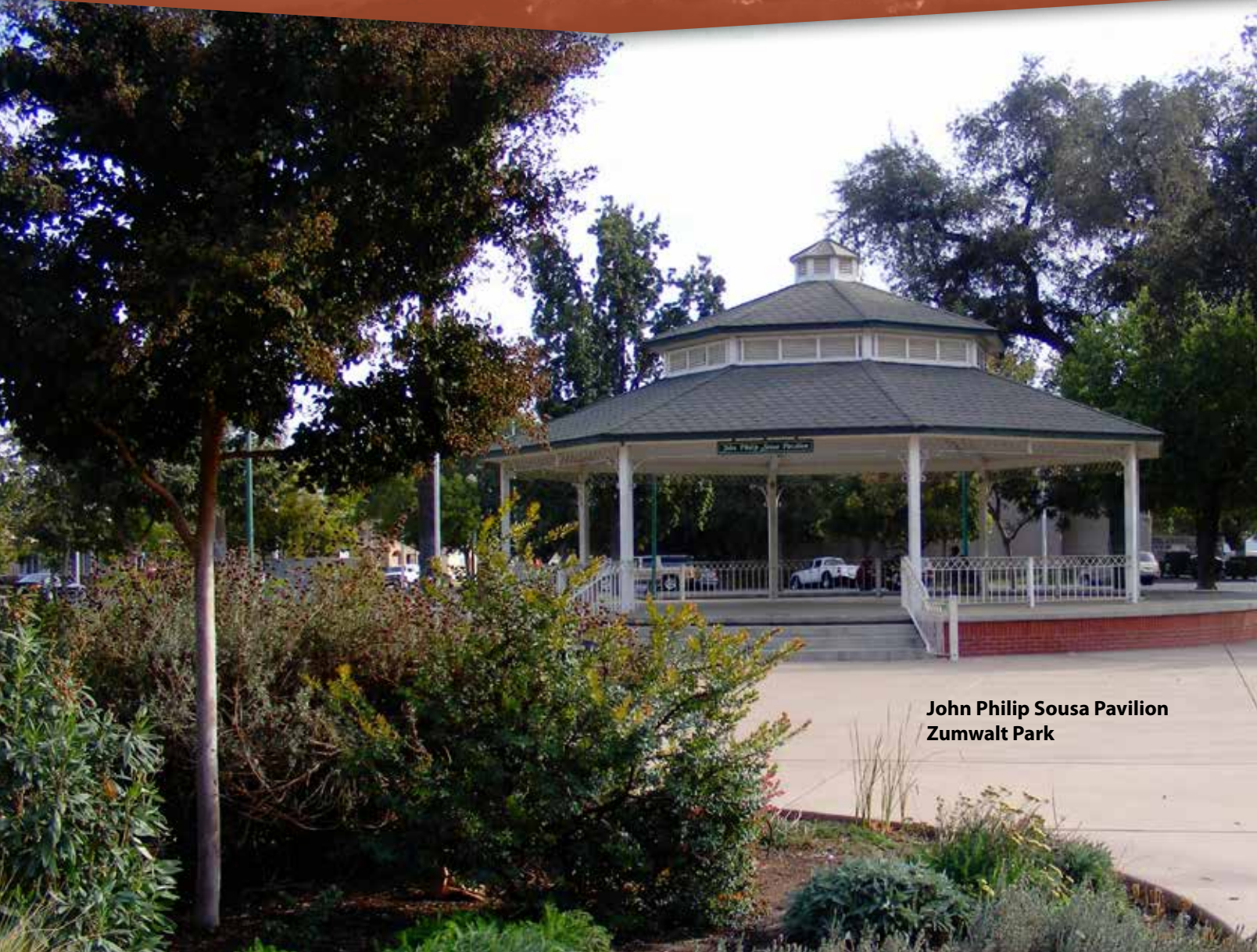
John Philip Sousa Pavilion Zumwalt Park