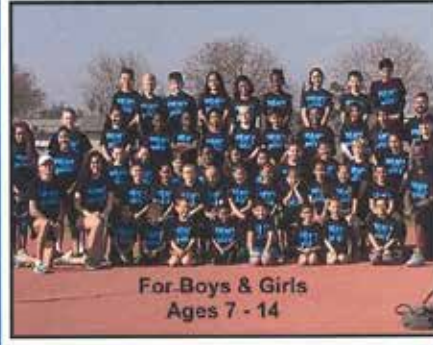
For Boys & Girls Ages 7 - 14