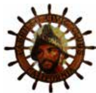
Tulare Cabrillo Club