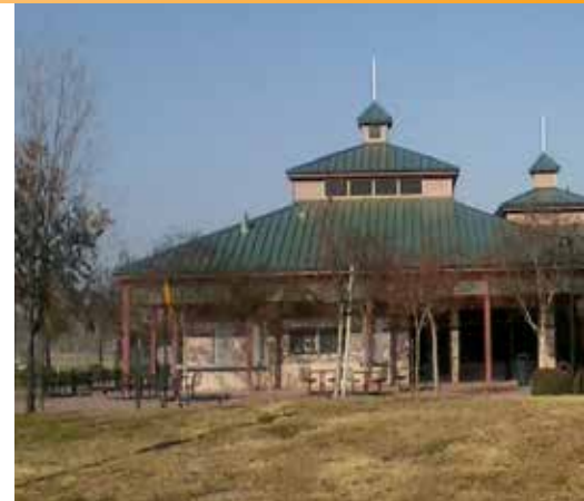
Prosperity Sports Park Clubhouse 846 W. Prosperity Avenue

AFFORDABLY PRICED FACILITIES FOR ALL YOUR PARTY NEEDS! GREAT VENUES FOR: WEDDING RECEPTIONS • BIRTHDAY PARTIES • BRIDAL/BABY SHOWERS GRADUATION PARTIES • FAMILY REUNIONS • FUNDRAISING EVENTS MEETINGS