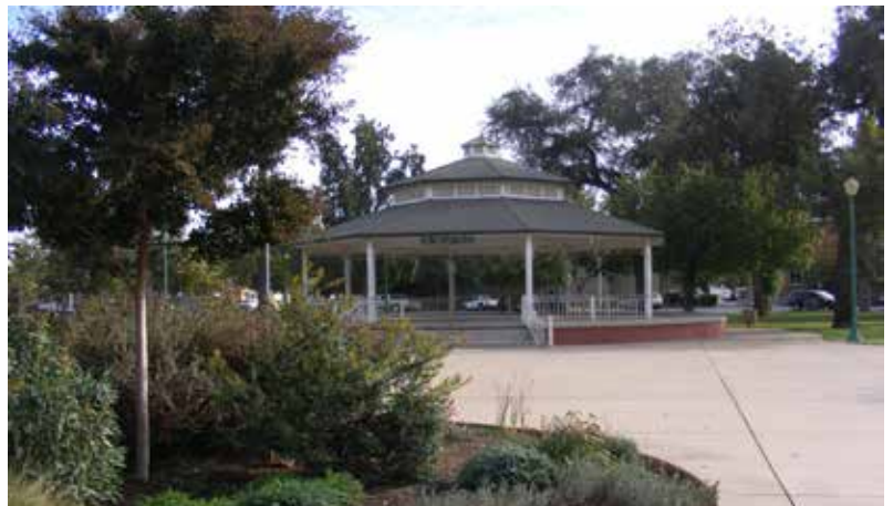
John Philip Sousa Pavilion Zumwalt Park