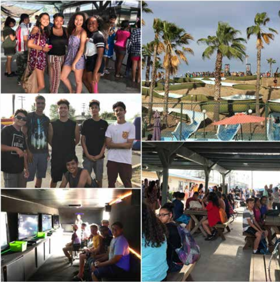
Teen Fest • Time Out Pizza & Fun Park