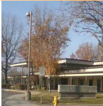
Senior Community Center 201 North F Street