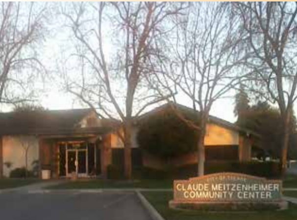
Meitzenheimer Community Center 830 S. Blackstone Street